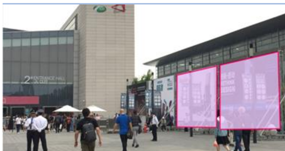
C01(a) Outdoor billboard – L (8mW)

Specification: 5mH x 8mW Price: RMB 18,000 / pcs