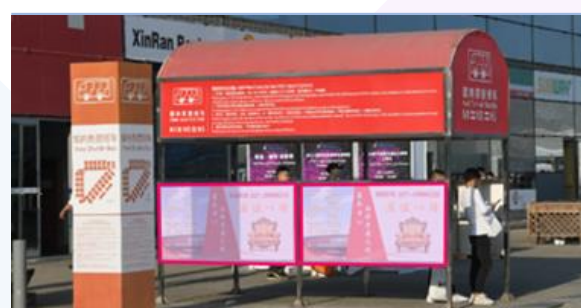
C05 Inter-hall shuttle bus station

Specification: 0.7mH x 5mW x 2-side Price: RMB 6,000 / 2-side / pcs