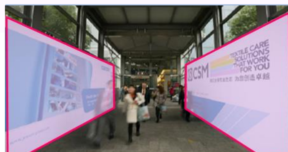
C03 Corridor ad on the ground (New)

Specification: (a) Right side: 2.365mH x 8.45mW (b) Left side: 2.365mH x 5.02mW Price: (a) RMB 30,000 / pcs; (b) RMB 20,000 / pcs