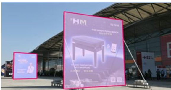
C06 Outdoor billboard – Plaza area (2-side)

Specification: 5mH x 4mW x 2-side Price: RMB 16,000 / 2-side / pcs