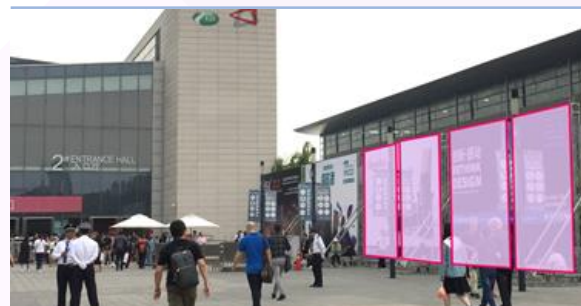
C01(b) Outdoor billboard – S (4mW)

Specification: 5mH x 8mW Price: RMB 18,000 / pcs