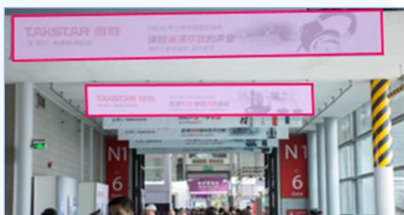
C04 Hanging banner – Corridor (New) (Halls N1-N2)

Price: (a) L – 2.5mH x 12mW: RMB 22,000 / pcs (b) M – 2.5mH x 8mW: RMB 16,000 / pcs (c) S – 2.5mH x 3mW: RMB 7,000 / pcs