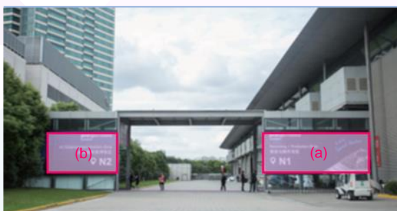
C02 Glass sticker (New) – North Registration Hall to Hall N1

Specification: 5mH x 4mW Price: RMB 11,000 / pcs